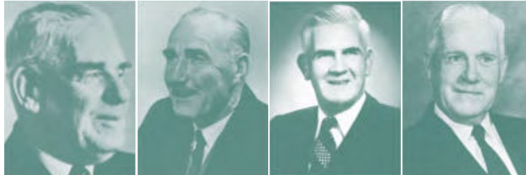
TOBIN BROTHERS FUNERALS COMPANY FOUNDERS

For over 90 years, Tobin Brothers Funerals has been owned and operated by the Tobin family, with 13 family members across 4 generations working in a variety of roles within the business.