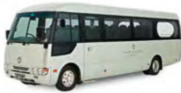
Family Funeral Coach