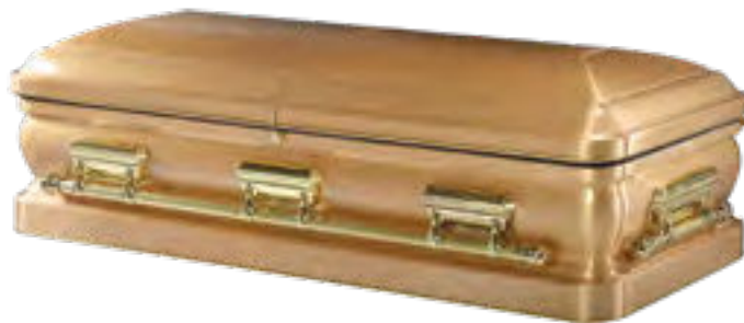
MAJESTIC GOLD 48 oz Bronze