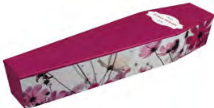
FIELD OF FLOWERS