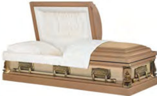
PYRENEES 18 Gauge Steel