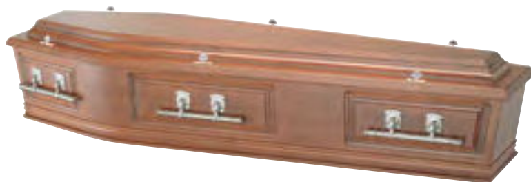
HOTHAM Radiata Pine