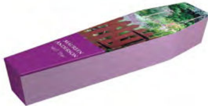
INTO THE GARDEN