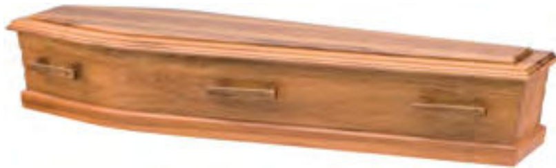
DERWENT Tasmanian Blackwood