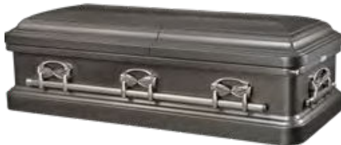
SORRENTO - SHADOW 18 Gauge Steel