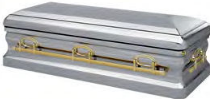
MILLENNIUM Stainless Steel