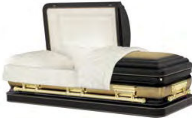
GOLDFIELDS 48 oz Bronze

Our range of metal caskets come in 18 gauge steel, 48 oz bronze and stainless steel.