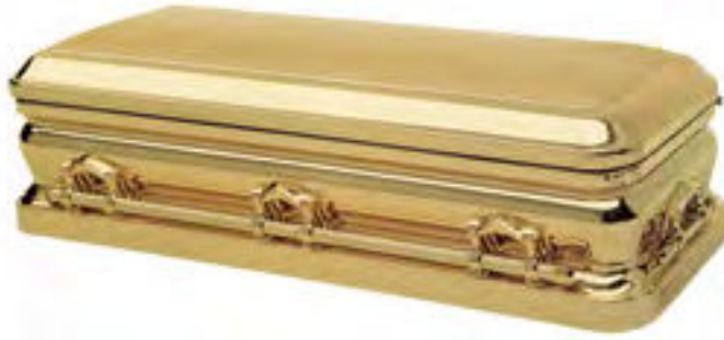
PROMETHEAN 48 oz Bronze

Our range of metal caskets come in 18 gauge steel, 48 oz bronze and stainless steel.