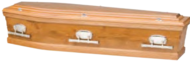
DAYLESFORD American Oak

Our solid timber coffins come in a range of soft and hardwood timbers including Radiata Pine, Tasmanian Blackwood, Cedar and Oak.