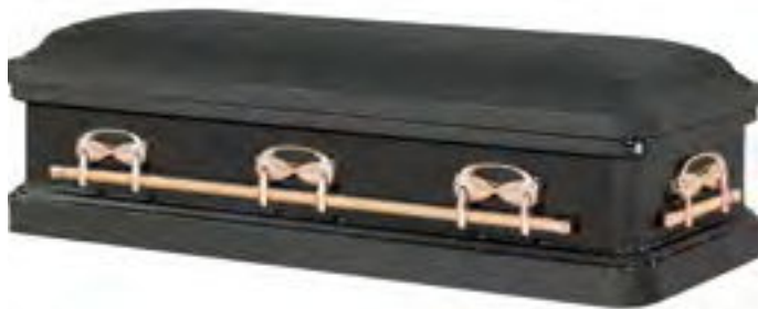
SORRENTO - MIDNIGHT 18 Gauge Steel