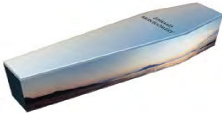
CROSSING THE BAR